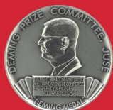
DEMING PRIZE 2003